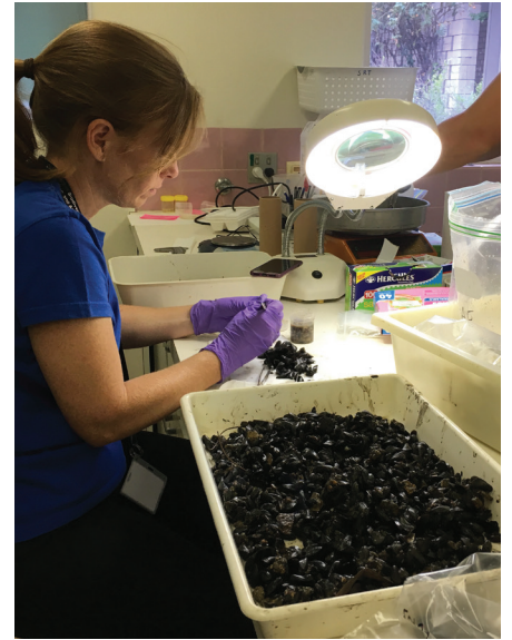
Above Toxicity assessments were undertaken on mussels, crabs, and fish from the Riverpark.

Below The head, guts and gills of crabs collected from the river should be removed before consumption.